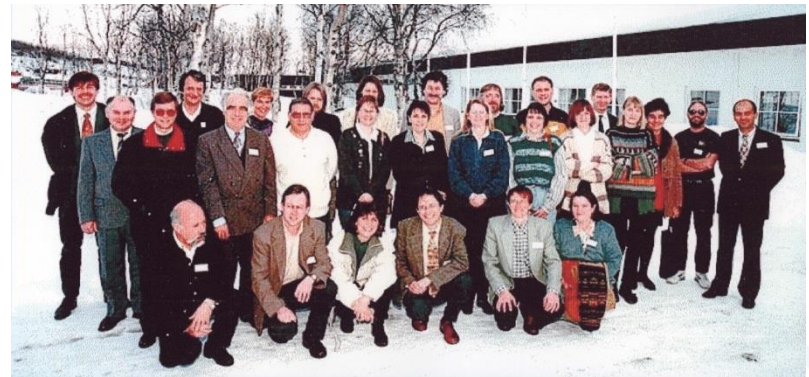
Beitostølen, Norway 1997