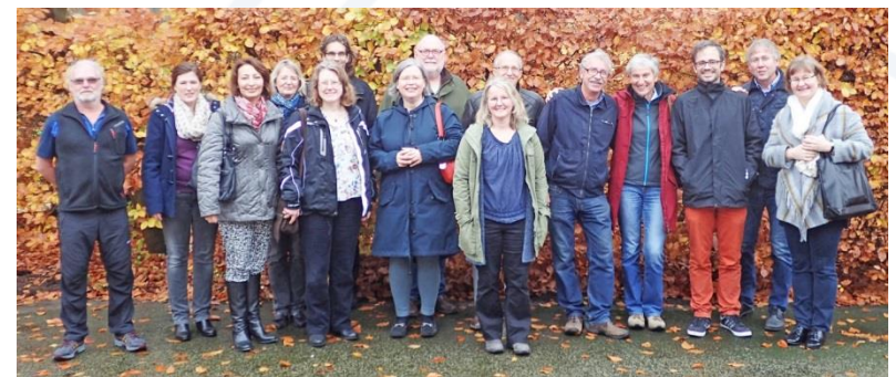
Alnarp, Sweden 2015