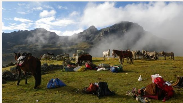
Lolium plant collection Huayhuash, Peru