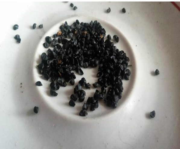
Sets from village Kolkja, May 2014